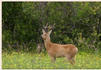
Asiatic Roe Deer