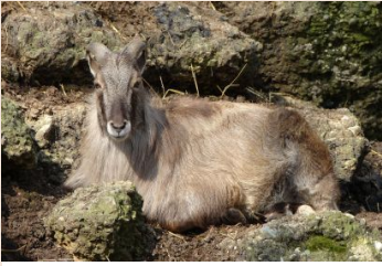
Tahr, Himalayan (Asia)