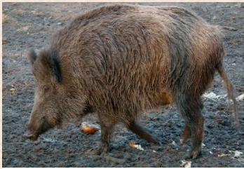
Wild Boar (Asia)