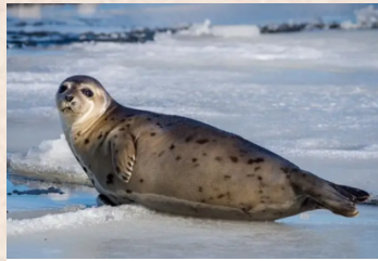
Greenland seal and ringed seal