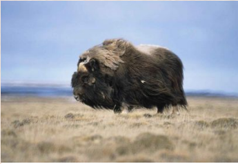
Musk Ox (North America)