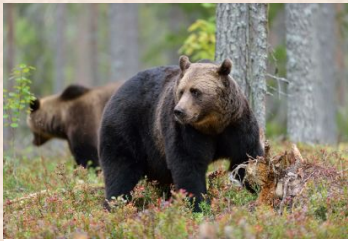
Brown Bear (Europe)