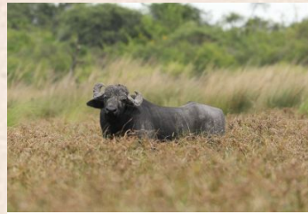
Water Buffalo (South America)