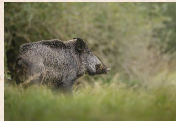
Wild Boar (South America)