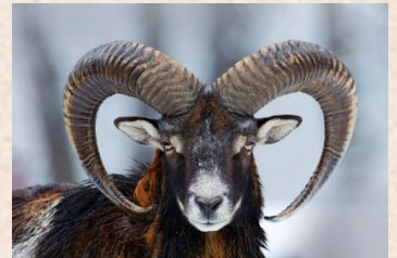
Mouflon (South America)