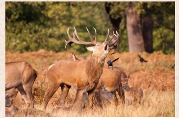
Red Deer/Red Stag (South America)