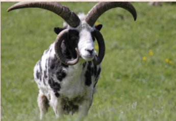
Multi-horned sheep (South America)