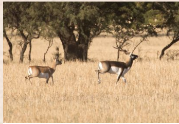
Bezoar Antelope/Black Buck