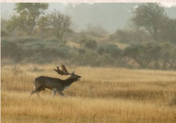
Fallow Deer (South America)