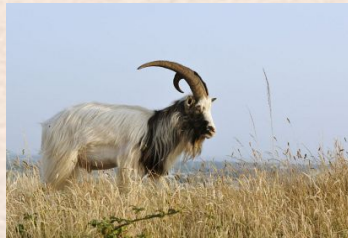
Feral Goat (South America)