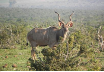
Kudu, East Cape